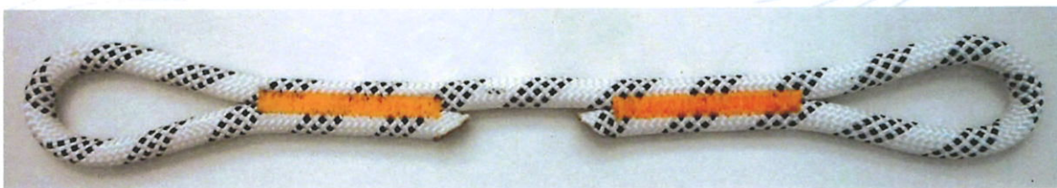
"TENDON eStatic 11 mm with sewn eye"